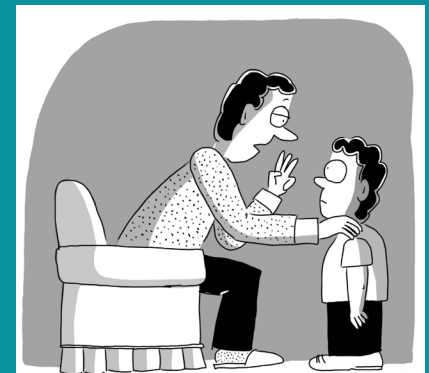
“SON, THERE'S THREE THINGS I WANT YOU TO NEVER FORGET...NEVER GIVE UP ON A DREAM...MARRY FOR LOVE...AND USE 8-DIGIT COMPLEX PASSWORDS!”