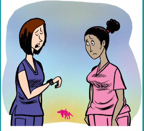
"A hacker logged into my fitness tracker and stole all my steps!"